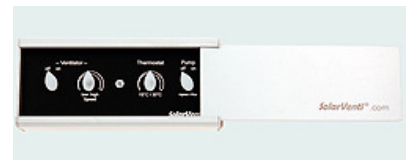
Dimensions: 60 x 135 mm