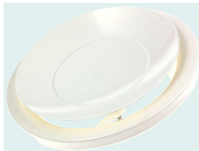
Indoor air vent